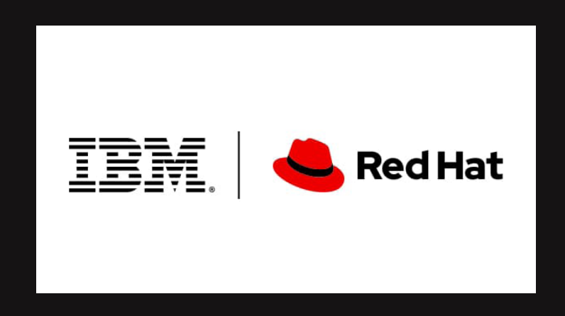
Learn more about Red Hat Reduce IT spend and drive innovation. →