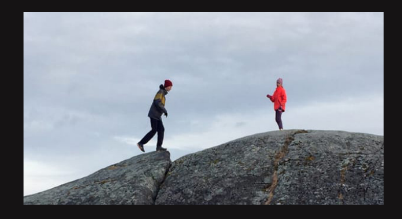
Top 10 best practices for multicloud management The new multicloud world is changing the face of IT. \Rightarrow